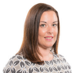
Vikki Howells AM Welsh Labour