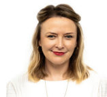
Bethan Sayed AM Plaid Cymru